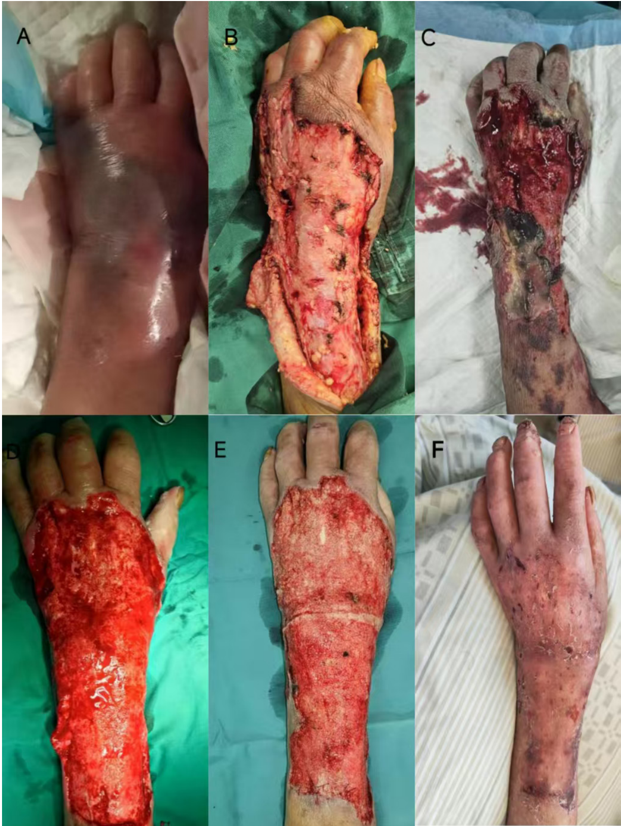
Figure 1. Wound Progression. (A) On emergency admission, the patient had significant swelling of the left hand and forearm. (B) Debridement was performed for the first time, and VSD suction was placed postoperatively. (C) After the first VSD, a large amount of necrotic tissue was still seen. (D) After the second VSD, the local infection was significantly improved, and the basal granulation growth was unsatisfactory. (E) After the third VSD, the granulation tissue grew satisfactorily and healthy skin was grafted to the granulation tissue. (F) The skin survived, and left hand function was preserved.